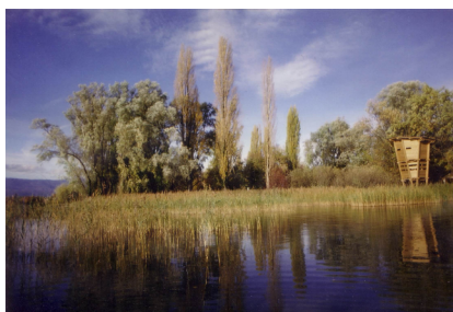
Pointe à la Bise Nature Center, image: Pro Natura Genève.