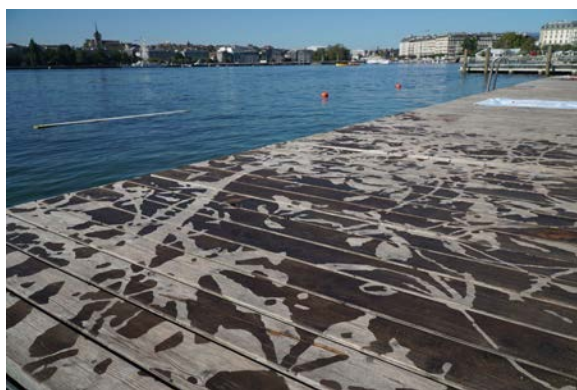
Monica Ursina Jäger, Sous-bois. Forestal Stories from Underwater , 2023, © The artist