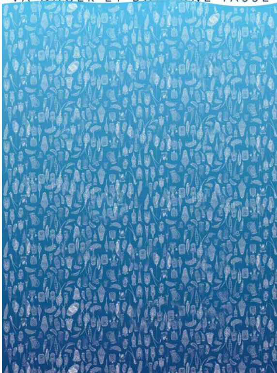
Carmen Perrin, Bois la tasse , 2023, Instructional work created for (re)connecting.earth, © The artist