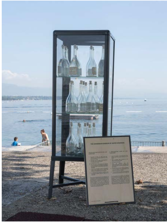
Luis Camnitzer, The Hahnemann Museum of Water Drawings , 2023