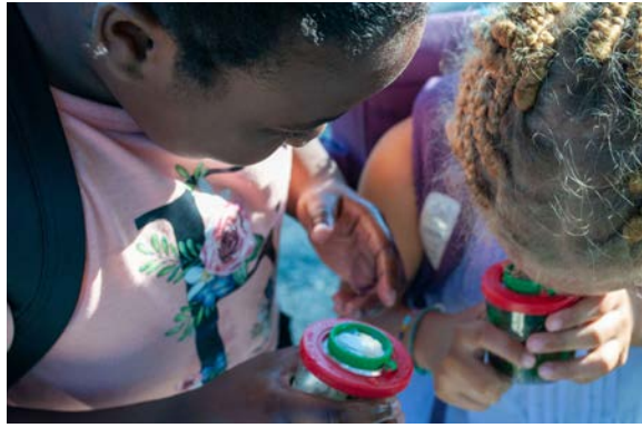
Lake workshops at Bains des Pâquis with primary school pupils, Geneva, 2023