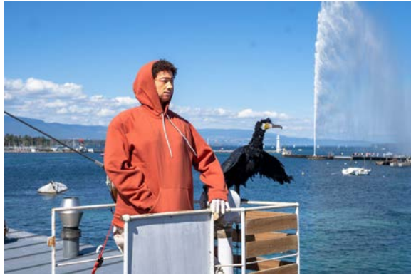
Collective Tchan-Zâca, La Conversation du Cormoran , Geneva, 2023, © The artists