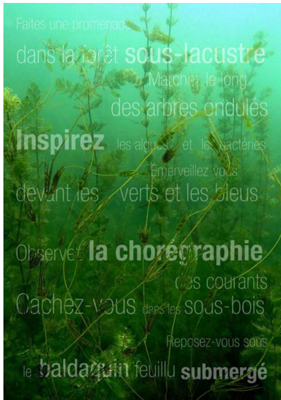
Monica Ursina Jäger, Sous-bois. Forestal Stories from Underwater , Instructional work created for (re)connecting.earth , © The artist