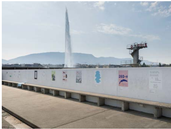
Exhibition of instructional works at the Bains des Pâquis, Geneva, 2023