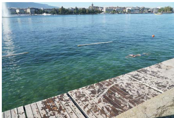
Monica Ursina Jäger, Sous-bois. Forestal Stories from Underwater , 2023, © The artist