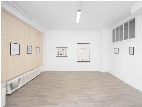
Mark Dion, Les Oiseaux , 2020, Aquatic Nets , 2013, Bird Song Pavillion , 2010, Field Station Honda - A project for FLORA , 2013, Ichthyosaurus , 2013, My Art P(r)actice Mind Map , 2020, The Mystics , 2020, view of the exhibition at the Association pour la Sauvegarde du Léman, Geneva, 2023