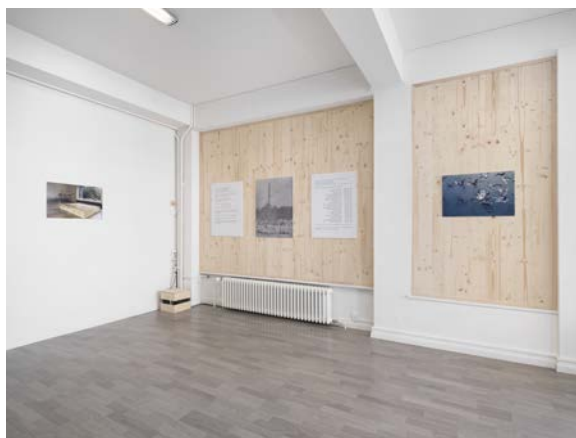
Hans Haacke, Krefelder Abwasser-Triptychon , 1972, Rheinwasseraufbereitungsanlage , 1972, Life Airborne System , 1965, view of the exhibition at the Association pour la Sauvegarde du Léman, Geneva, 2023