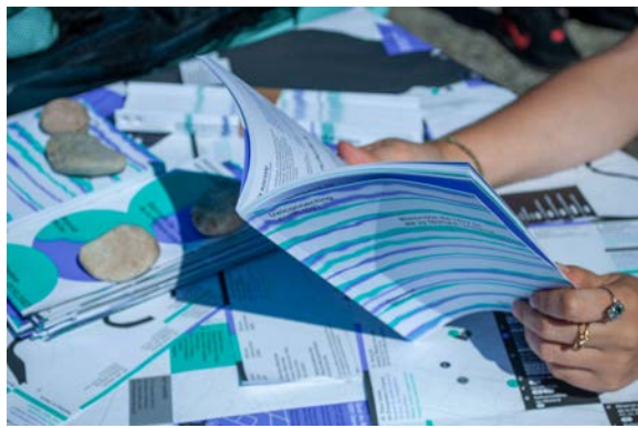
Biennial Visitors' Guide, (re)connecting.earth (02) – Beyond Water