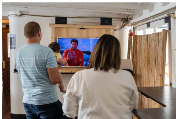
Collective Tchan-Zâca, La Conversation du Cormoran , Geneva, 2023, © The artists