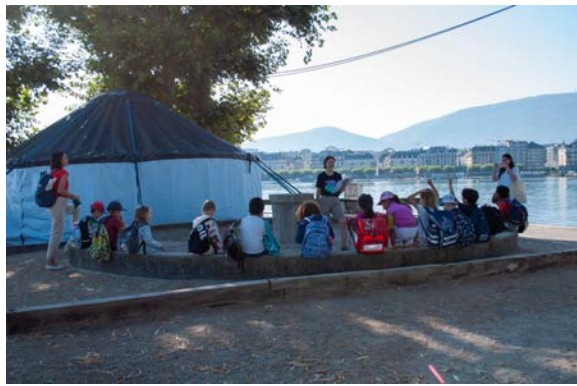
Lake workshops at Bains des Pâquis with primary school pupils, Geneva 2023, © Lucille Chaboche