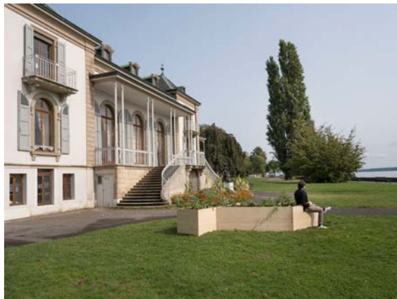
Uriel Orlow, Proposition for a garden (Geneva) , 2023, © Julien Gremaud