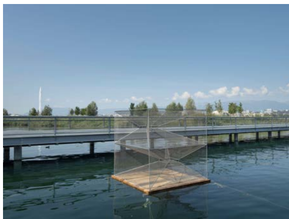
Carmen Perrin, Lignes de fuites , 2023, © Julien Gremaud