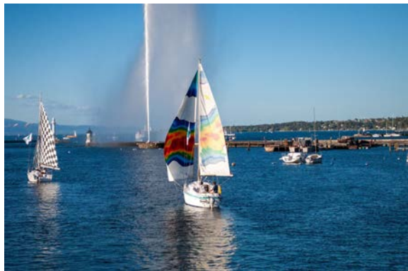
Performance by Raul Walch's sailboats on Lake Geneva with Anyone Can Sail, 1 September 2023, © Lucille Chaboche