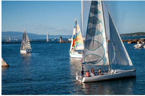
Performance by Raul Walch's sailboats on Lake Geneva with Anyone Can Sail, 1 September 2023