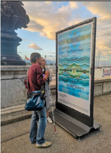
Guided tour of the (re)connecting. earth Biennial (02), 2023.