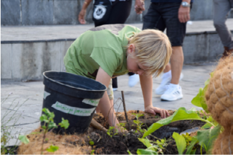
(re)connecting.earth Biennial (02) 2023, botanical workshop.