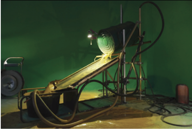
Ana Alenso, The mine gives, the mine takes , 2020. ©Ana Alenso

A view of part of Ana Alenso's installation, which will be on display at the Villa du Parc (contemporary art centre). Other works will be on display at the Comédie de Genève.